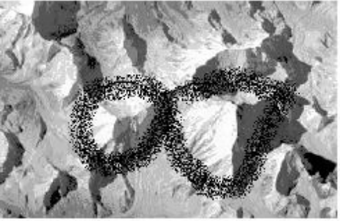
Figure 3: A vague partition of the Himalayas